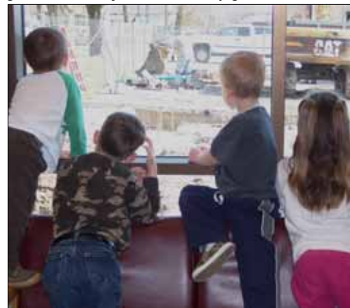
Children watch the construction in anticipation of the new children's room in the Ellettsville branch.

We are all very excited about this project and would like to invite you to come out and visit us—either as the work progresses, in a forthcoming open house, or just as a library patron. ■