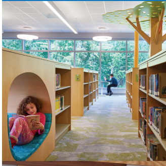
Children's room Donor wall Amphitheater and labyrinth Hyper Local Cooking Series