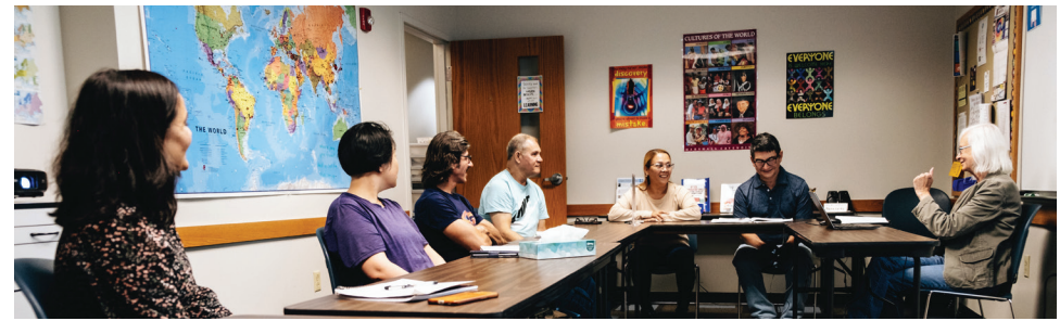
VITAL English Conversation Group