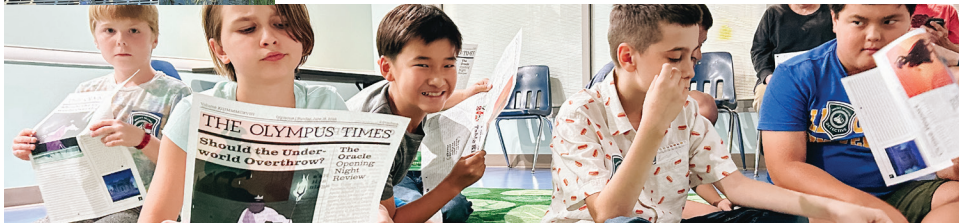
Murder on Mount Olympus after-hours program

Families enjoyed programs funded by the Friends, including a Wildcare, Inc. Meet-and-Greet, Giant Game Day, a Murder on Mount Olympus after-hours program, Tween Craft Club, and more! 2,518 children took game boards to participate in the Camp Myth Summer Reading Program.