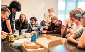
Eat What Now?!