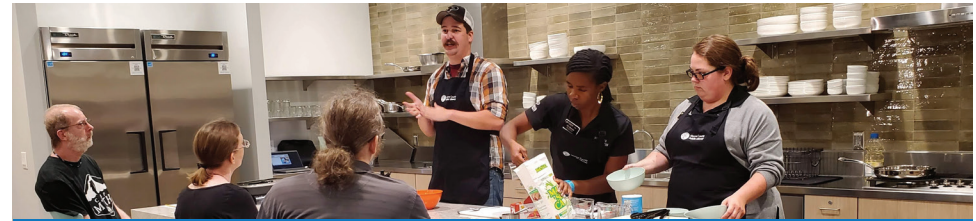
Culture Through Crops: Central America