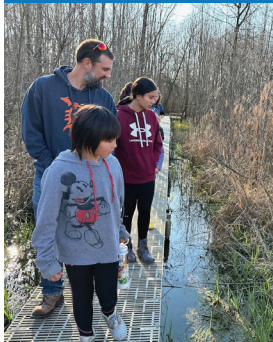
Frog & Toad Chorus Wetland Walk